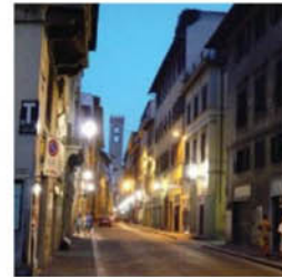
Nothing overwhelms all the senses quite like Florence, Italy.