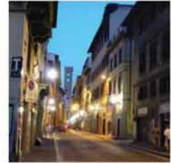
Nothing overwhelms all the senses quite like Florence, Italy.

and wellness center, swimming pool, Pazzia Pizzeria, stylish Bar Visconti and the visionary Ristorante Toscana. Casale owners and their guests are welcome to use the hotel's amenities anytime. The hotel will provide additional room availability for guests of Casale owners, and also will be open for those savvy travelers who find it. Consider yourself informed. M