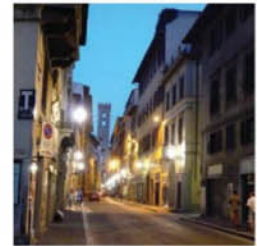
Nothing overwhelms all the senses quite like Florence, Italy.