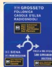
First Roundabout Sign