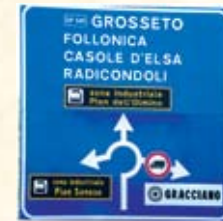
Third Roundabout Sign