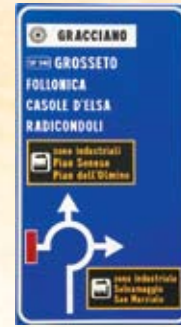
Second Roundabout Sign